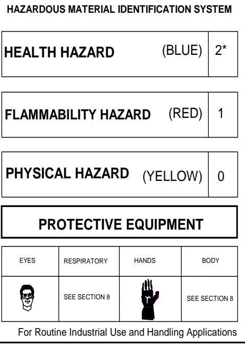
Hazard Scale: 0 = Minimal 1 = Slight 2 = Moderate 3 = Serious 4 = Severe * = Chronic hazard